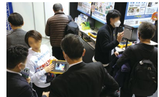
Image reference from SMART ENERGY WEEK 2023